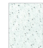
15mm x 20mm

PuraExtend is a resorbable collagen membrane made from purified porcine dermis tissue, offering a balanced combination of strength, handling, and resorption. Its highly purified intact collagen provides long-lasting protection for 6-9 months while maintaining barrier function.