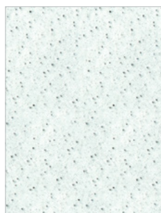
30mm x 40mm