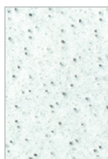
20mm x 30mm